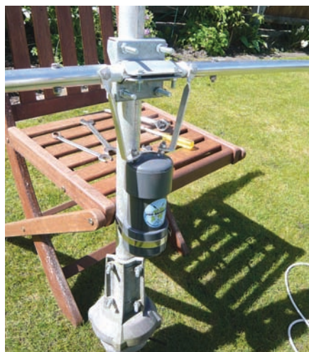
A close up view of the central insulating rod, matching transformer and rotator in their final positions.