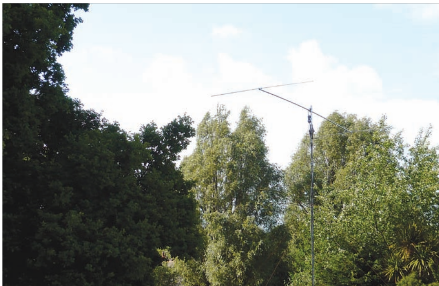
The tree on the left of the photograph towers to twice the height of the beam.

My on the air test periods included very early mornings, very late nights